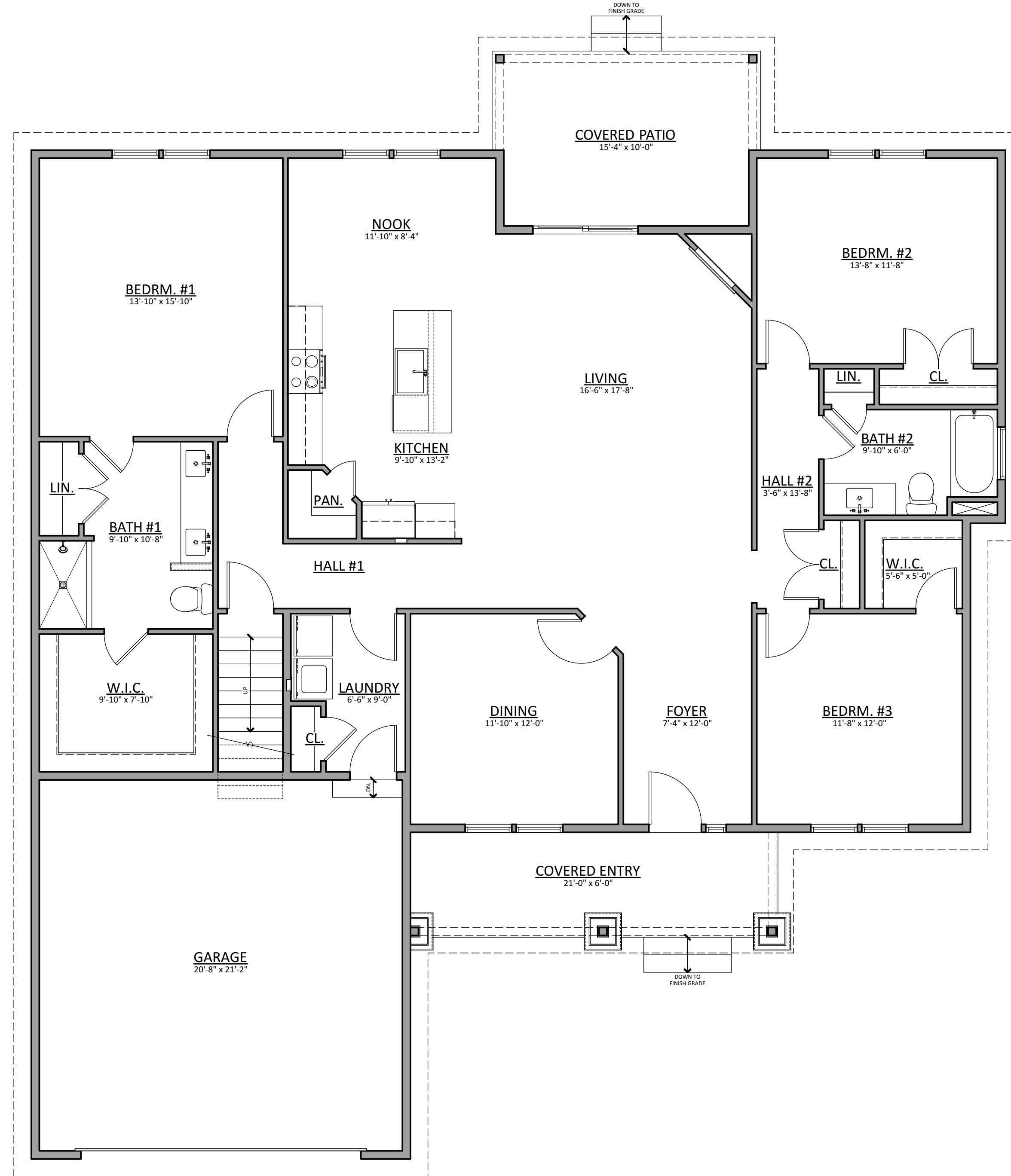
MAIN LEVEL FLOOR PLAN N.T.S.