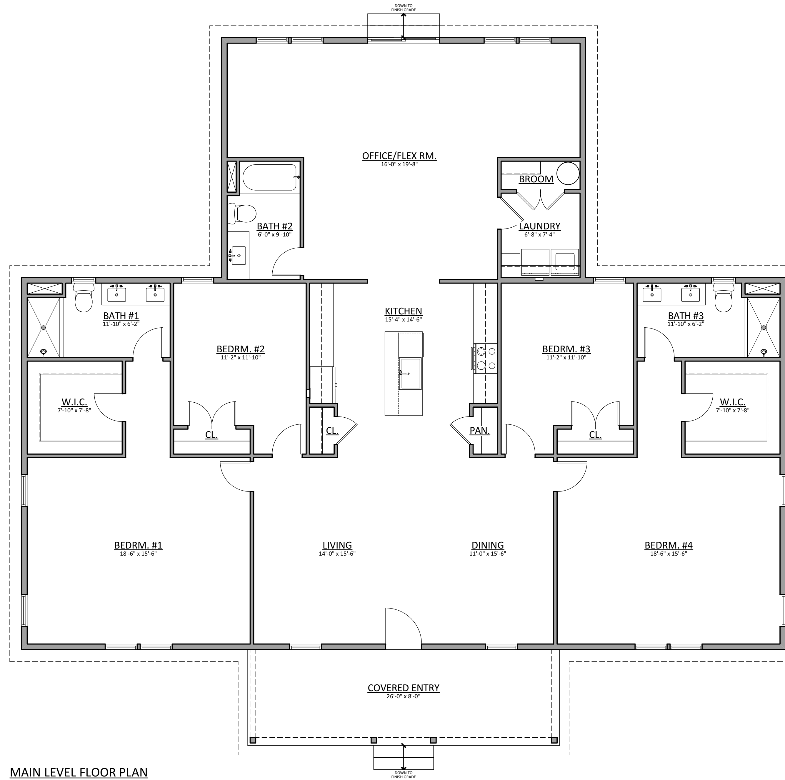
MAIN LEVEL FLOOR PLAN N.T.S.